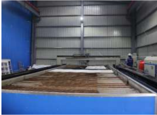
1 Unit of CNC Water Cutter 9 x 3 Meter