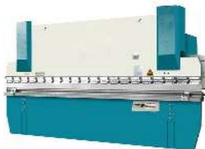
1 Unit of 200 Ton Hydraulic Bending Machine