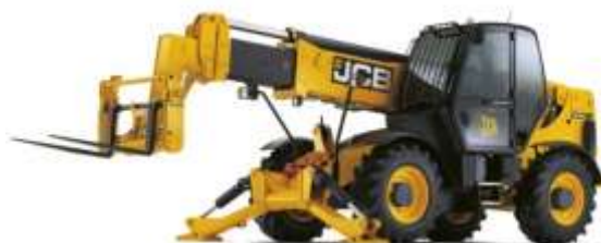
2 Units of Telehandler Machines