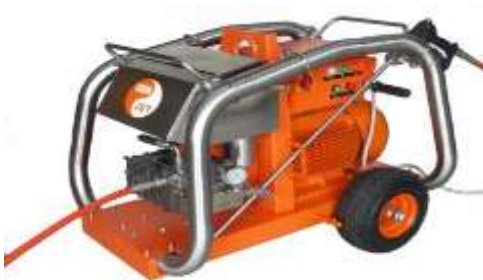
2 Units High Pressure Water Blaster 500 bar and 2 Units High Pressure Water Blaster 180 bar