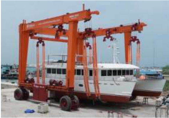
1 Unit of Mobile Boat Hauler Capacity 300 Ton and maximum width is 13 Meter