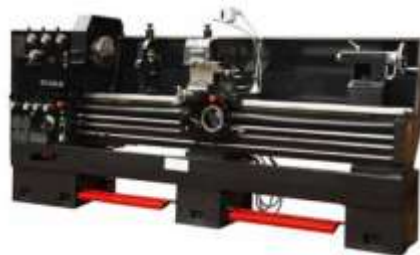
2 Units of 2 and 6 Meter Lathe Machines