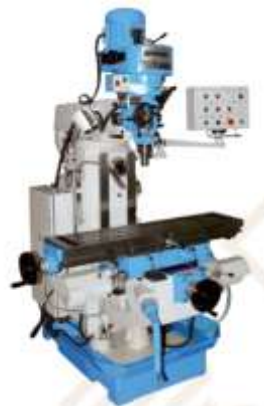
1 Unit of Universal Milling Machine