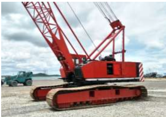
1 Unit of 50T Crawler Crane